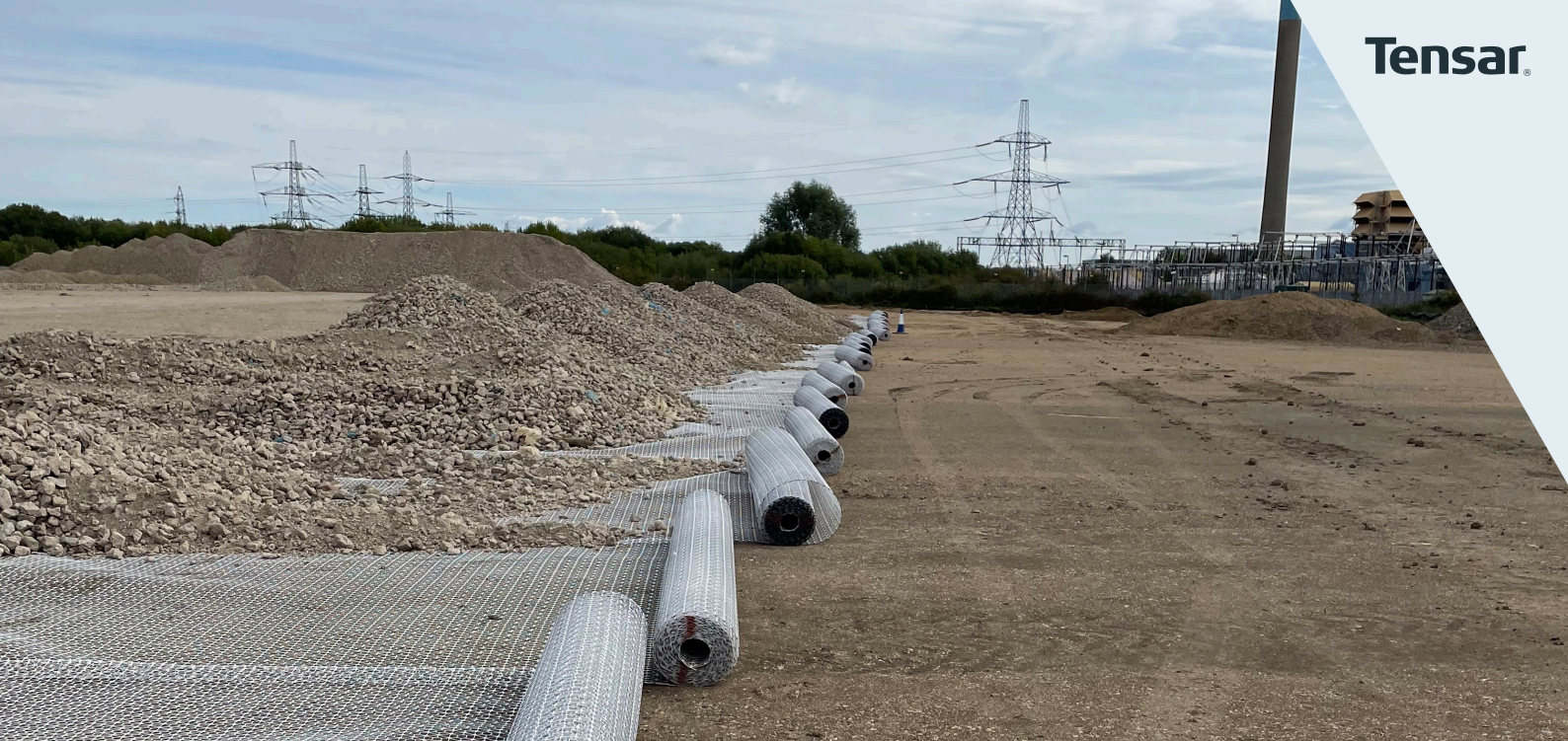
Tensor Mechanically Stabilised Layer (MSL) stabilising the working platform for piling rig operation